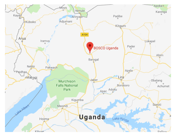
Figure 1: Location of the experience

This experience called "Skill set for efficient and effective staff achievement of organisational and project goals" was conducted from 2016 until 2018 at 5 different connectivity, electricity and "Education for Entrepreneurships" (CE3) sites in the Acholi and Lango sub-region. This experience reports mainly the activities undertaken within the organisation to support capacity development among the staff in managing project needs.